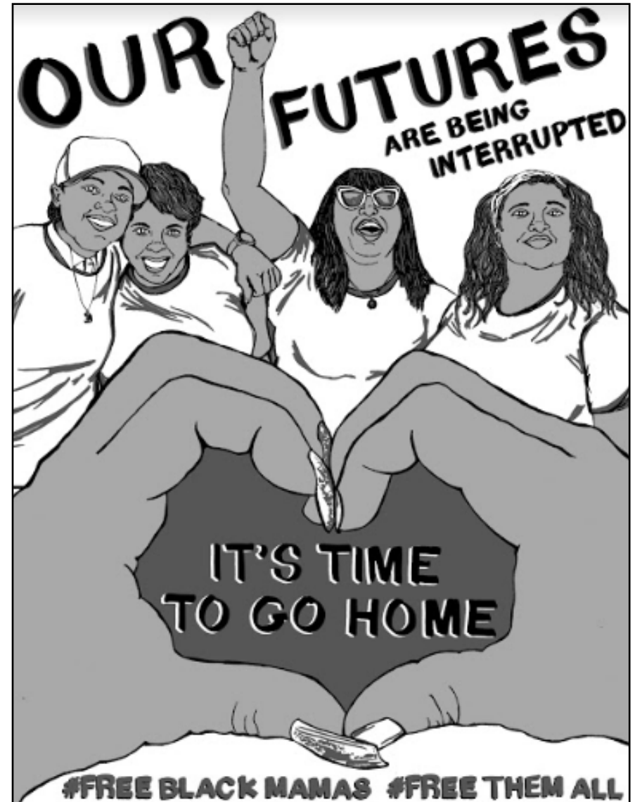
Artwork by Molly Fair in collaboration with The People's Paper Co-op

Prisons have not been as quick to change policies and arrange for releases. But at least 20 states have taken measures to release people from prison, especially those nearing the end of their sentence, those charged with nonviolent offenses who “pose no threat to public safety,” and those held for technical probation or parole violations. Protest organizers are demanding the release of people who are at higher risk for severe illness if they get COVID-19, regardless of what they were convicted for.